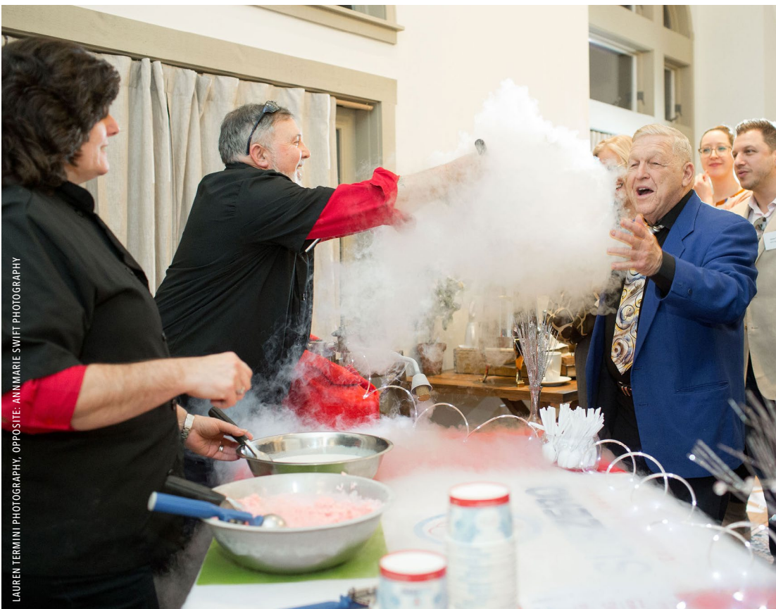
LAUREN TERMINI PHOTOGRAPHY, OPPOSITE: ANN MARIE SWIFT PHOTOGRAPHY