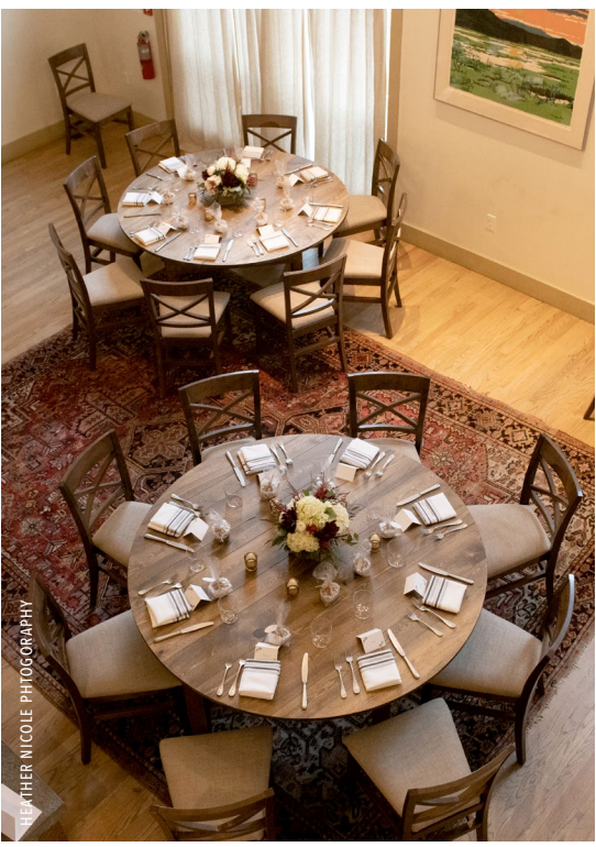
LEATHER NICOLE PHOTOGRAPHY