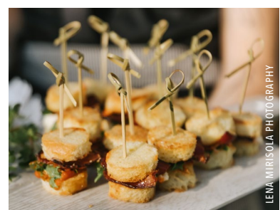
LENA MIRISOLA PHOTOGRAPHY